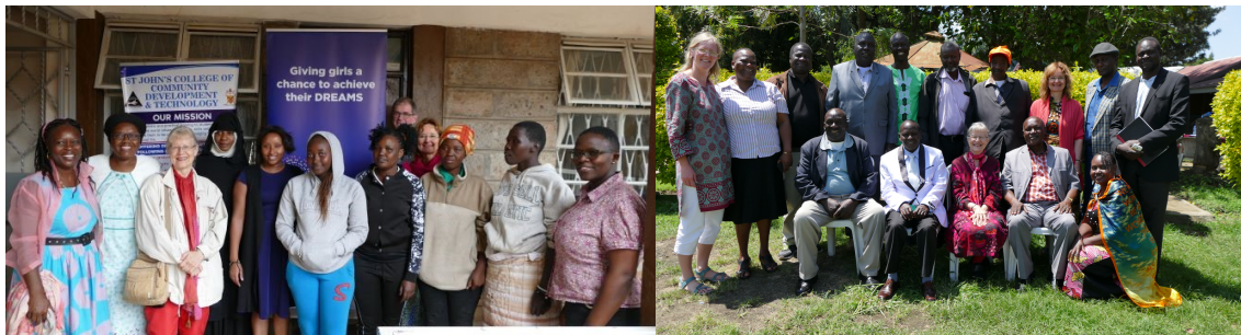
The Feminenza team with some of the girls that attended the THCRD workshop during the DREAMS Initiative programme and Elders/Members of the District Peace Committees that we interviewed in Nakuru.

While in Kenya, we were able to follow up with participants of two of our THCRD workshops. The first meeting was with some young women who participated in our workshop in 2016 in the context of the DREAMS initiative. They had become the go-to persons within the programme, the young women others would turn to for advice. The young women said that the workshop had been impactful, that it taught them to love again, trust again and it allowed them to make use of the opportunities provided to them as they saw their lives mattered. One of the women interviewed was studying, a few others started a small business and one of them actually had travelled to Europe to show traditional Kenyan dancing. It was very good to witness that the impact of the workshop had been sustainable in the young women and also in one of the counselors who wants to be part of a practitioner training, should it go ahead.