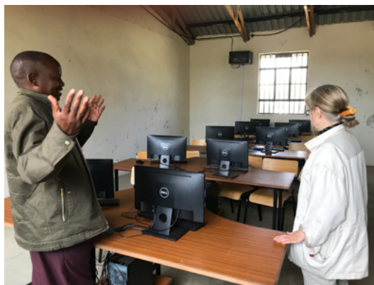
The computer room at the Tasaru rescue centre which will be fitted with webcams